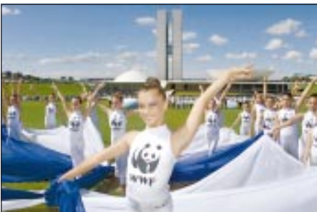
World Wildlife Fund (WWF) demonstrators perform in front of Brazilian National Congress, in Brasilia, on Thursday. The act is part of celebrations of World Environment Day and the International Year of Freshwater.

In China, the world's most populous country, the government said it planned to invest more than $30 billion over the next few years to fight water pollution and help relieve