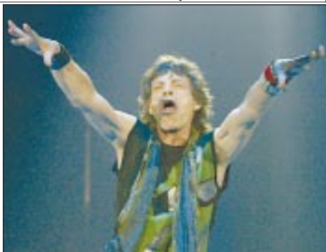
Mick Jagger, lead vocalist of the Rolling Stones, performs during a concert in Munich, Germany on Wednesday.

Production is set to start over the summer and could be broadcast as early as November.