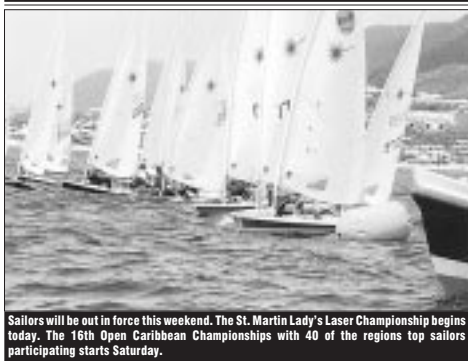
Sailors will be out in force this weekend. The St. Martin Lady's Laser Championship begins today. The 16th Open Caribbean Championships with 40 of the regions top sailors participating starts Saturday.

The Caribbean Alliance Cup will conclude with the finals Sunday evening.