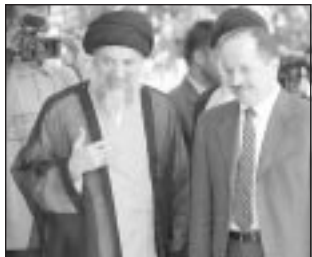
Iraqi Shi'ite leader Ayatollah Mohammed Baqer al-Hakim (L) greets Kurdish leader Masoud Barzani in the holy city of Najaf on Thursday.