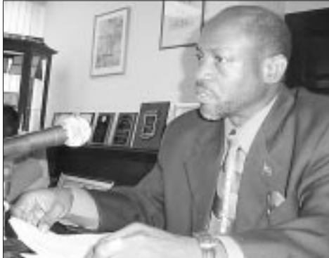
Prime Minister Dr. Denzil Douglas

He noted that there had been a number of responses to the challenges created by external factors and that the