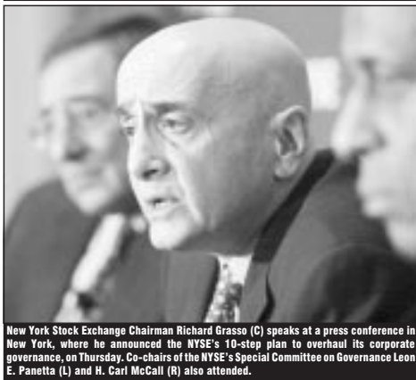
New York Stock Exchange Chairman Richard Grasso (C) speaks at a press conference in New York, where he announced the NYSE's 10-step plan to overhaul its corporate governance, on Thursday. Co-chairs of the NYSE's Special Committee on Governance Leon E. Panetta (L) and H. Carl McCall (R) also attended.