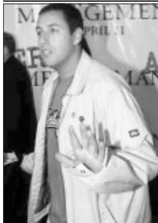
Actor Adam Sandler, who stepped out of his comedic mold to star in Paul Thomas Anderson's "Punch-Drunk Love" last year, may be making another departure.

According to the group, South Africa is home to more individuals living with either HIV or AIDS, over 5 million people, than any other country. Each day, 1,600 South Africans become infected and 600 more lose their lives from AIDS-related illnesses.