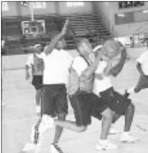
The No Limits appeared able to drive to the basket, but did not sink many shots as they faced the Middle Region Vipers at L.B. Scott Sports Auditorium yesterday.

An Anguilla selection will tip off against St. Martin at 11:00am Saturday. There will be a 3-point shoot-out at 2:00pm, followed by the half court shoot competition. Anguilla will tip off against the St. Martin Kingdom Games qualification team at