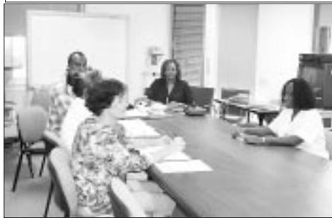
One of the nurses being grilled by instructors during Thursday's exam