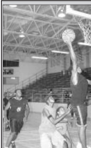
The Ebenezer Street Ballers, making another lay-up here, made short work of dispatching the Cay Hill Celtics at the L.B. Scott Sports Auditorium yesterday.