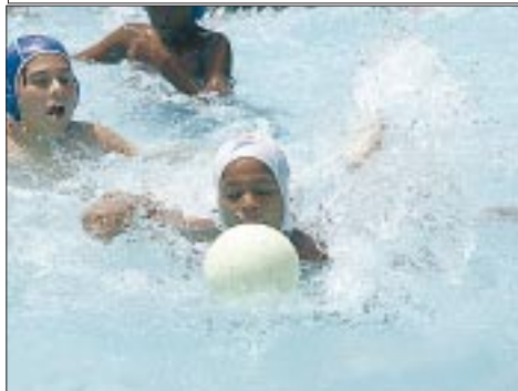
The annual school water polo competition comes to a close today. The Dr. Maarten Luther King Jr. School squeezed past the Seventh Day Adventists yesterday.