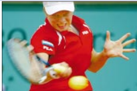
Kim Clijsters of Belgium plays against Nadia Petrova of Russia in the semifinal of the French tennis open at Roland Garros stadium, on Thursday.

But on Thursday there was no denying the waif-like blonde who tormented world number one Serena. The American had not lost in a grand slam since losing the