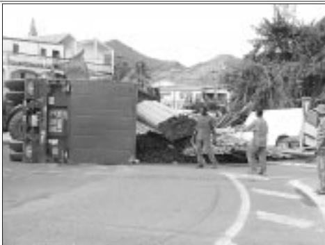
The tipped over trailer with the lumber spilling out of it.

Johnson said he was awaiting the finalization process of forming a Government at the Island level in Curaçao and the appointment of two informateurs before pursuing a party position on various issues.