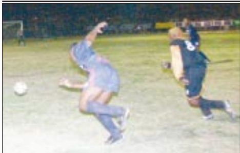
Number eight of the St. Martin Attackers races for the ball during the opening match of the Caribbean Alliance Cup at the Alberic Richards Stadium in Sandy Ground last night. The Attackers played Guadeloupe.