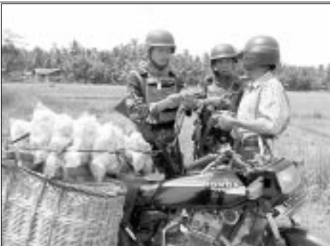
Indonesian soldiers check the id card of a motorcyclist in Tanjung Minjaj's village in the restive Aceh Province, on Thursday.

The Palestinians questioned Sharon's commitment to a two-state solution and to dismantling Jewish settlements in the West Bank and Gaza Strip, seized by Israel in the 1967 Middle East war. Palestinians want the territories for their own state.