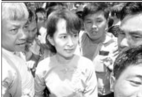
Pro-democracy opposition leader Aung San Suu Kyi is mobbed by supporters after being freed from 19 months in house arrest in Yangon in this May 6, 2002 file photo.

"We call on the ruling State Peace and Development Council (military rulers) in Burma to provide a full accounting of the dead, injured, and missing," he added. Washington uses the old name Burma as a sign of displeasure with the government. Reeker again called for the release of Suu Kyi and other members of her National League for Democracy, saying it was "outrageous and unacceptable" to detain them in isolation.