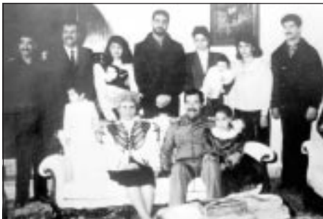
Uday Hussein (C) poses alongside his uncle General Hussein Kamel (L) and his father Saddam (2nd L) in this undated file photo of Iraqi President Saddam Hussein's family. The family members are daughters Raghda (3rd L) and Rana (3rd R), Qusy (R) and Iraqi President Saddam Hussein (sitting with his wife Sajida). Britain said it would have to consider any claim for political asylum from Saddam Hussein's daughters Raghda and Rana but would almost certainly turn it down. The woman (2nd R) is unidentified.