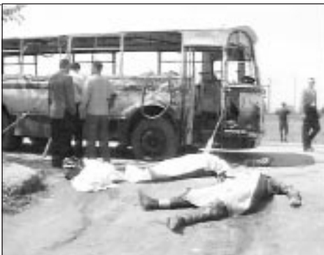
A frame from RTR television footage shows Russian investigators inspecting the site of a suicide bomber attack outside Mozdok in North Ossetia, on Thursday.

Asked why all council members except Washington wanted to discuss the future of U.N. inspections, Greenstock said, "Even the closest ally cannot answer for the United States."