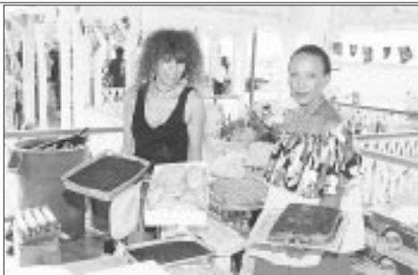
File photo of the ninth annual Food Festival.