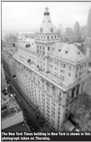
The New York Times building in New York is shown in this photograph taken on Thursday.

Blair, 27, faked dozens of those convictions, gave him one chance too many. When I look into my heart for the truth of that, the answer is yes."