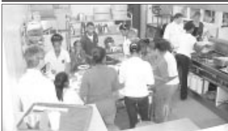
MPC students enjoying their own products in the kitchen of Sundial School.